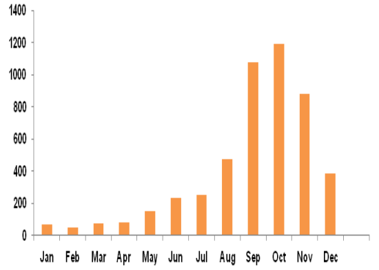
Fig. 1: 4972 cases seasonal variation in onset of the dengue infection in Karachi

Result showing the mean age for positive febrile cases diagnosed with active dengue disease. In this study, when positive cases were analyzed per different age groups it was found that the highest number of the patients belong to age group 21-30 years. However, 1-20 and, 30-50 years were also affected moderately (Fig. 3).