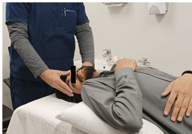
Fig No 1:

Group "B" included 42 patients on whom the Modified Epley manoeuvre was performed once in the office. The procedure was explained to them in detail and they were provided with a free online video link explaining the manoeuvre. All the patients were asked to perform the procedure independently once in front of the clinician, to gain confidence and memorize the steps of the procedure, then they were sent home with advice to perform the procedure thrice daily till the resolution of symptoms, at least for a total of 3-5 days at home.